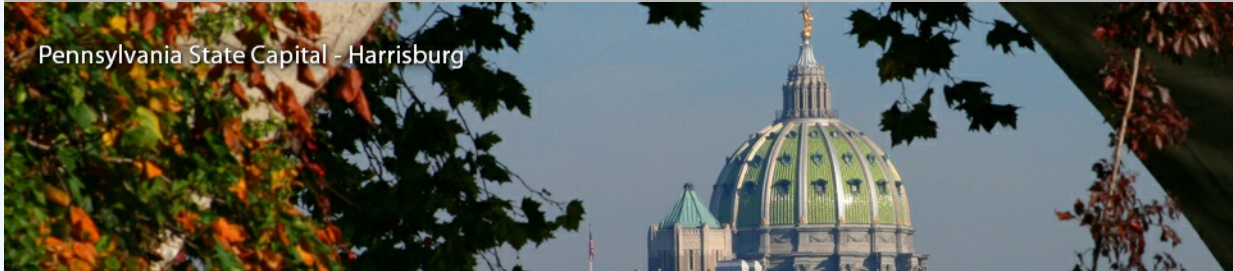
Pennsylvania State Capital - Harrisburg